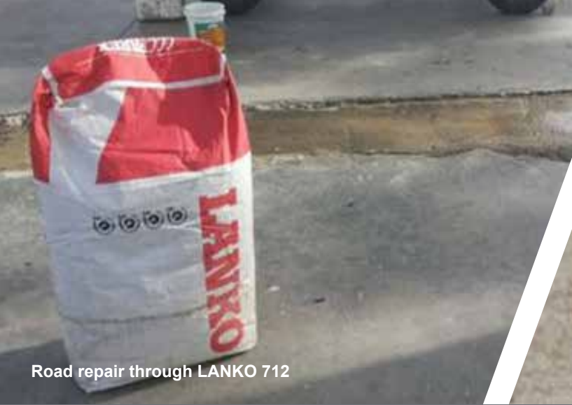
Road repair through LANKO 712